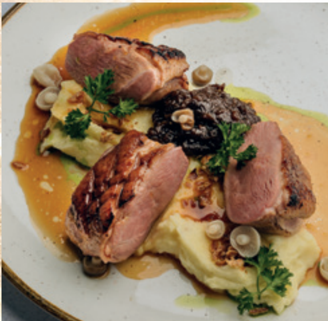
Rosé duck breast with roasted onion mashed potatoes and onion gravy