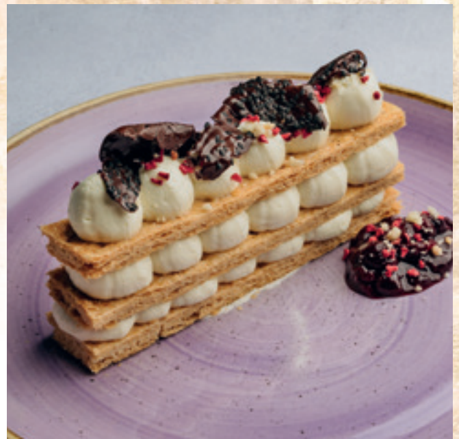
VarjúVár mille-feuille with homemade sour cherry coulis and black sesame chocolate tuile