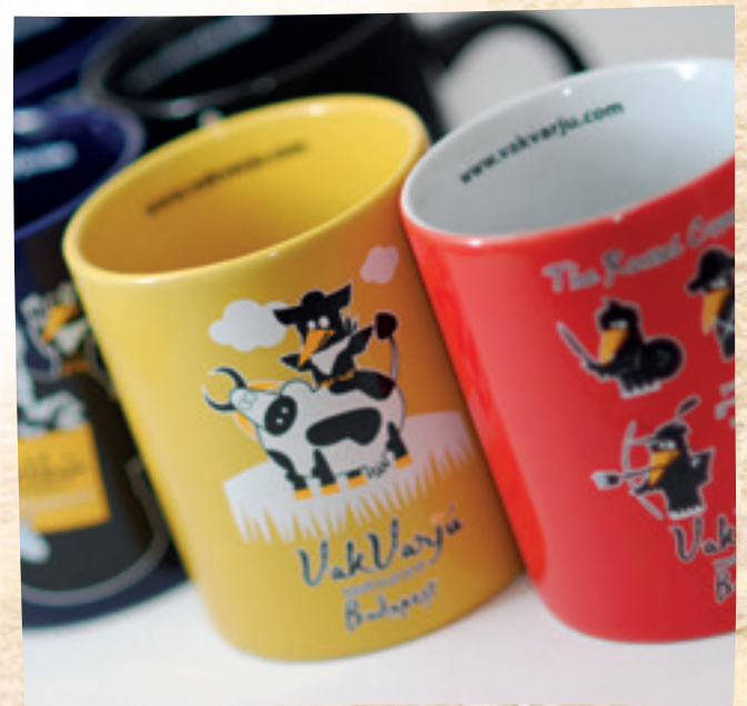
VakVarjú's cup 3 190 HUF/piece