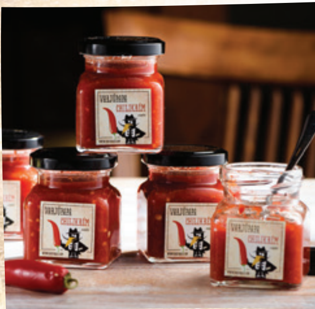
VarjúPapa chili cream: 1 990 HUF/piece