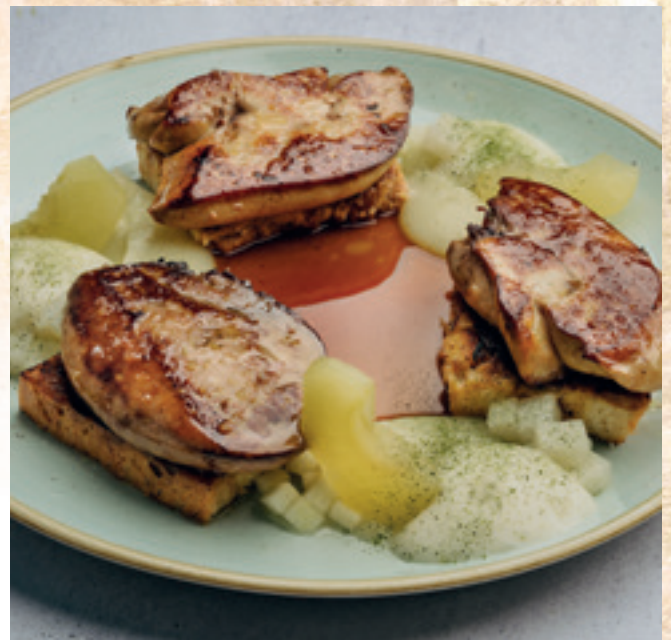
Pan-seared foie gras with citrus kohlrabi purée, green apples and toasted brioche pudding