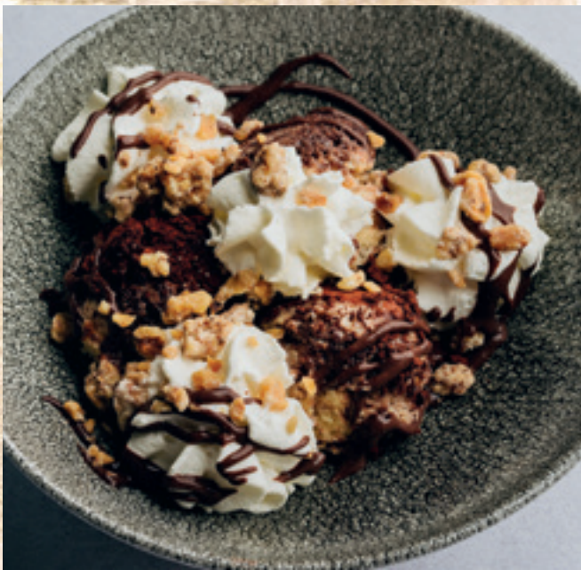
Somlói Galuska: Traditional Hungarian dessert with sponge cake, chocolate sauce, walnuts, and whipped cream