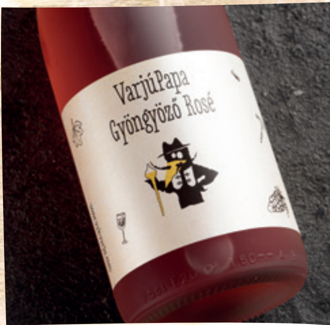
VarjúPapa's rosé wine 4 490 HUF/bottle/take away