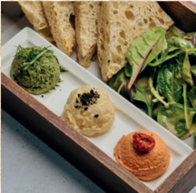
VarjúVár dip selection: smoked eggplant cream, green pesto hummus, tomato goat cheese labneh