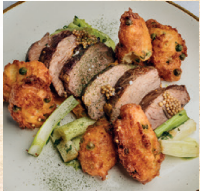
Tender lamb rump with mustard seed jus, Vászoly cheese green pea crisp, smoked chipotle and grilled spring onion