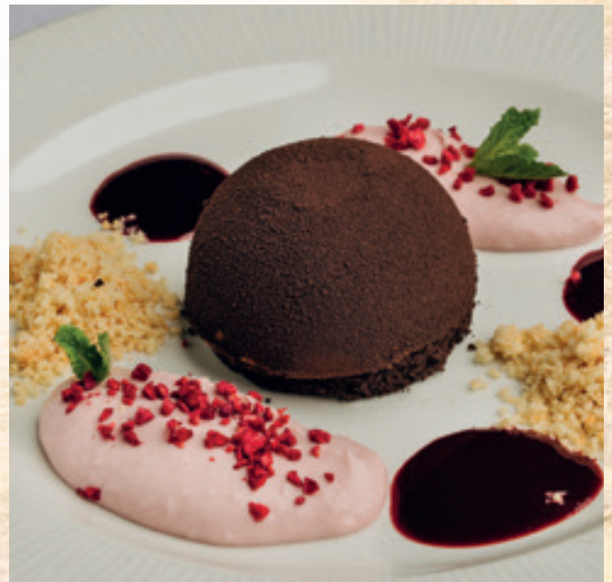
Raspberry dark chocolate mousse with blackberry coulis and almond crumble