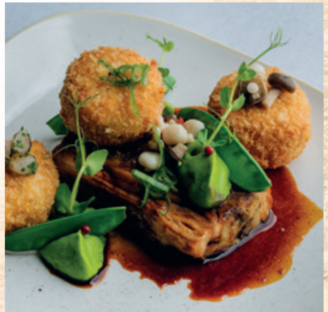
“Gödöllő-style chicken thigh”: pressed chicken breast, crispy cheese croquette, pickled shimeji mushrooms