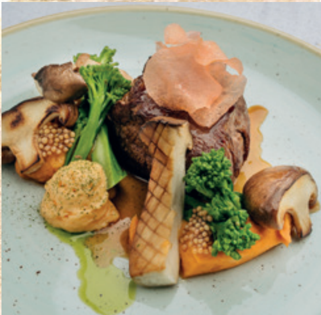
Beef tenderloin steak from Dembrovszky farm with miso sweet potato, sautéed summer mushrooms and wild broccoli