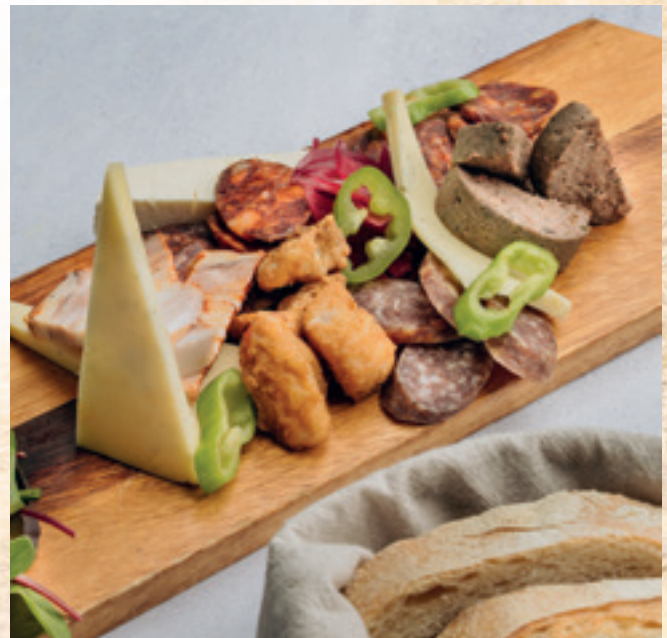
“CrowFarmers’ Pantry Selection”