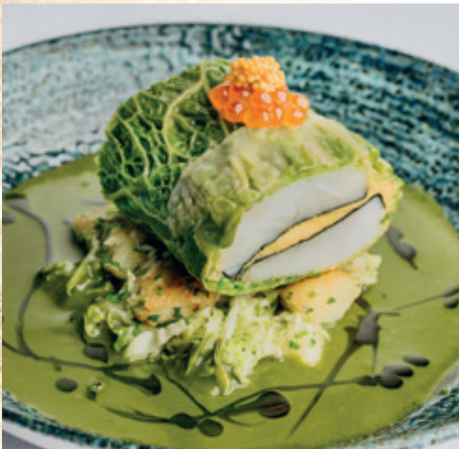
Cod à la Colbert with savoy cabbage buttered baby potatoes, summer spinach velouté and salmon caviar