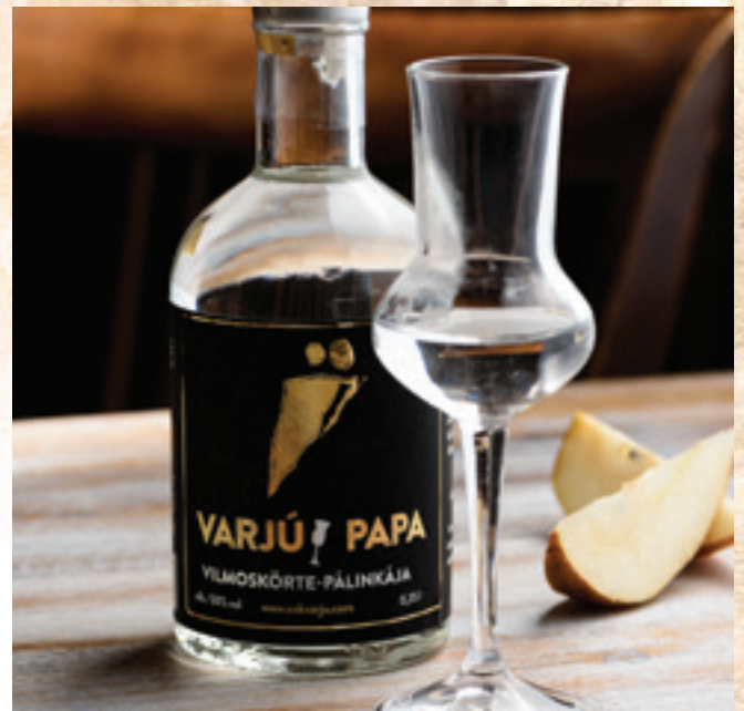
VarjúPapa's palinka 7 350 HUF/bottle/take away