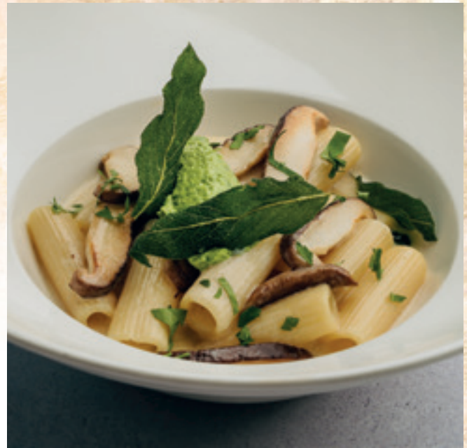
Parmesan rigatoni with sage goat cheese and sautéed shiitake mushrooms