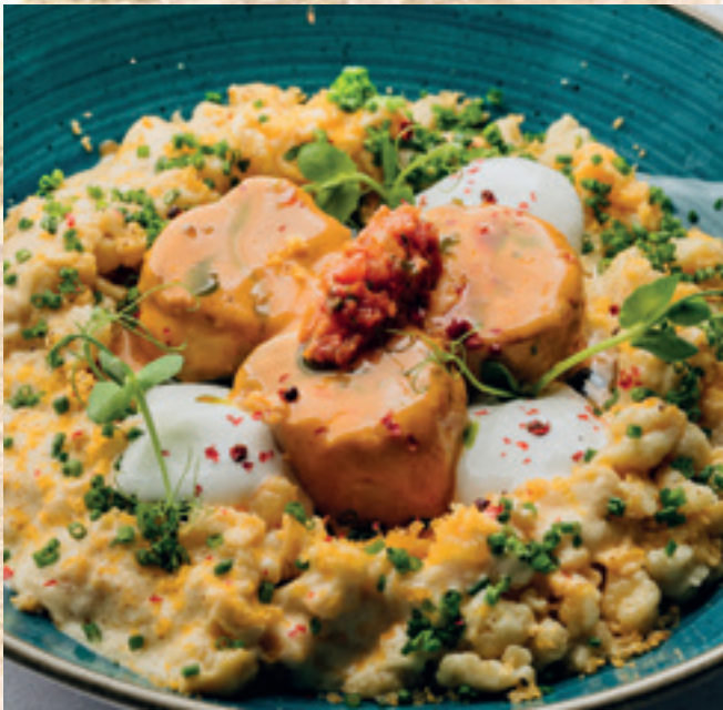
Farm-style chicken paprikash egg dumplings, sour cream foam and homemade cucumber salad