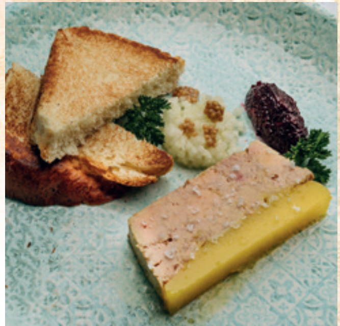
Duck liver terrine with sour cherry chutney, green apple, mustard seeds and brioche