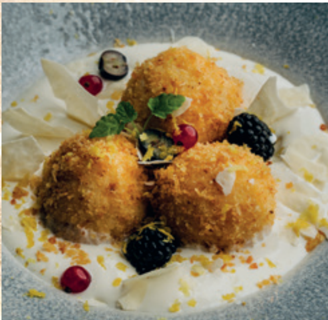
Cottage cheese dumplings in brown-butter panko with sweet sour cream and yogurt crunch