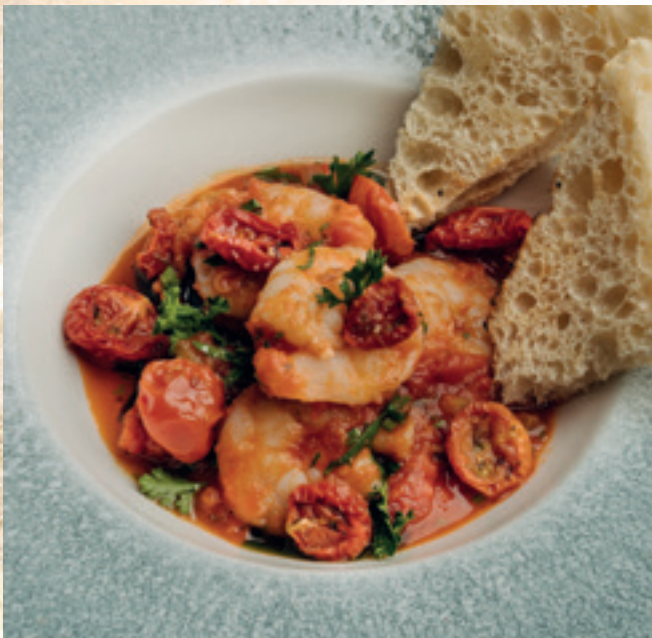
Pan-seared tiger prawns, roasted tomato sauce and focaccia