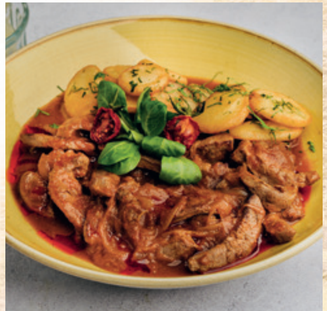
Sautéed veal liver with roasted potatoes and homemade pickled vegetable salad