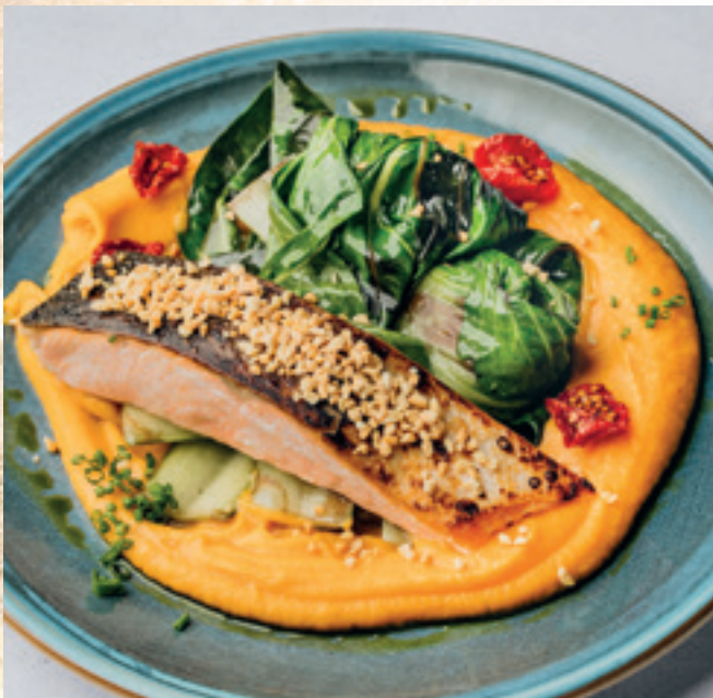
Grilled salmon fillet in hazelnut crust with sweet-potato purée and garlic Swiss chard