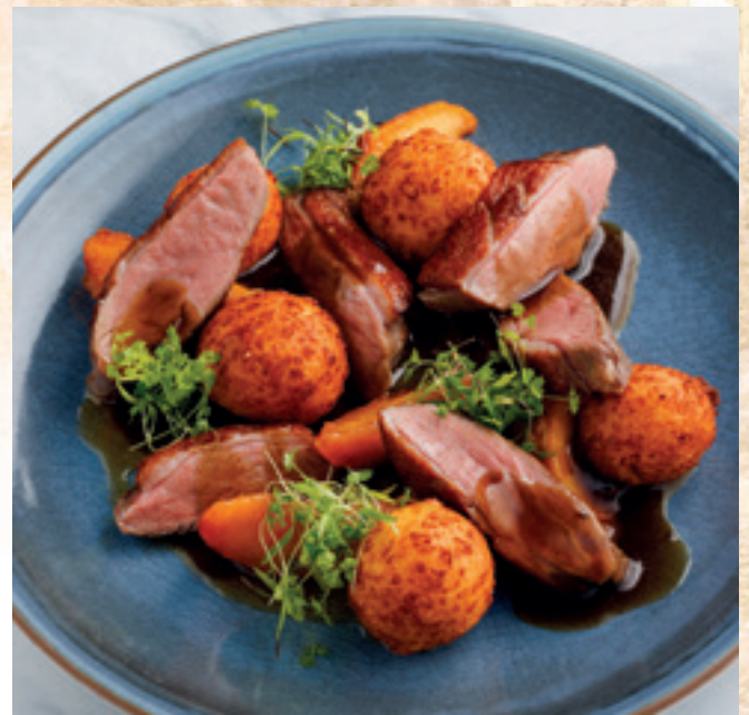
Rosé duck breast with cottage cheese donuts and nectarine chutney