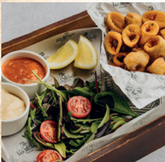
Calamari fritti with aioli and bravas sauce