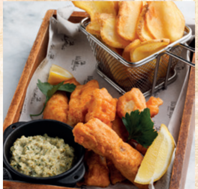
Hekk & chips with leavened cucumber relish