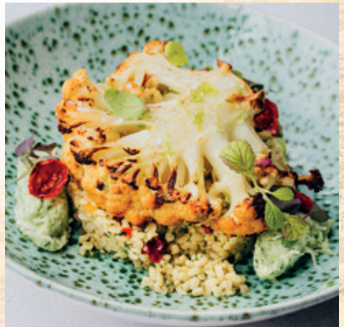
Lava stone grilled pike perch fillet with skordalia and grape salad with feta cheese