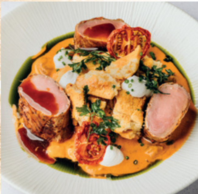
Pork tenderloin with dill porcini-paprikash and "Kaiserschmarrn" with sheep's curd cheese