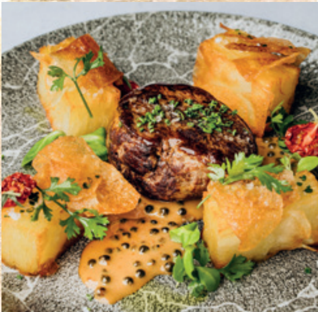
Beef tenderloin steak with green-pepper sauce and potato mille-feuille