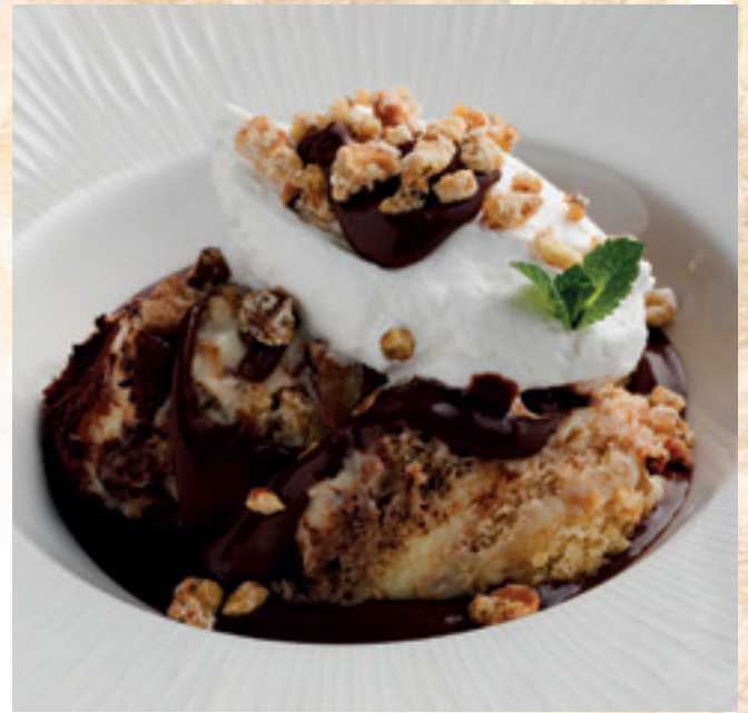
VakVarjú Somló-style sponge cake