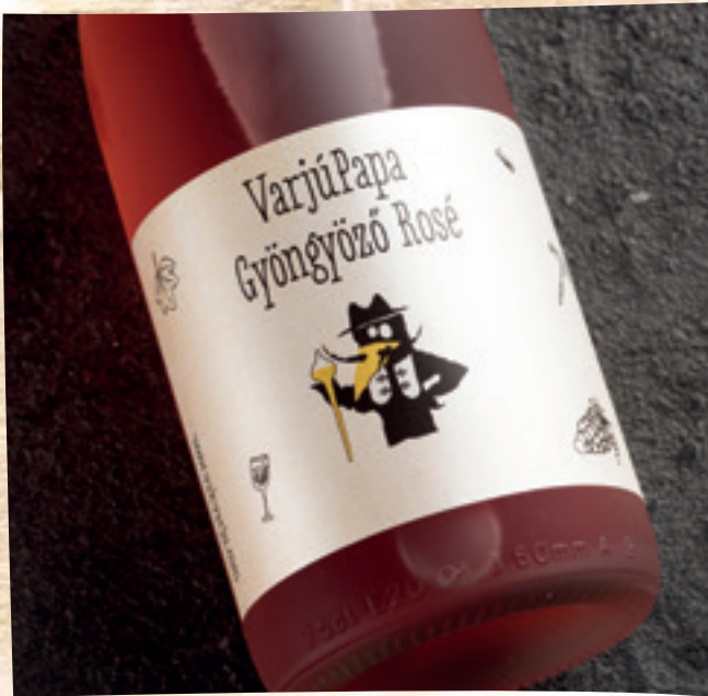
VarjúPapa's rosé wine