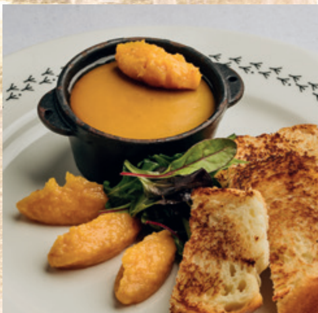
Duck liver mousse with elderflower jelly, apricot chutney and toasted milkloaf