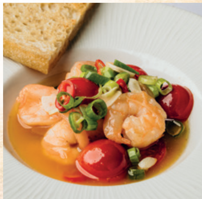
Tiger prawn in garlic-chili butter sauce with focaccia