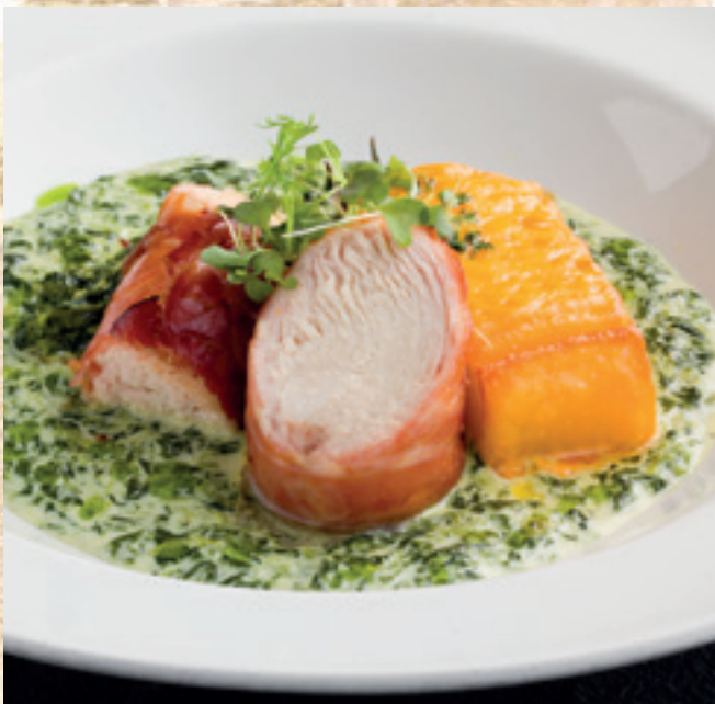
Chicken breast wrapped in black forest ham with creamy spinach and cheddar cheese Hasselback potatoes