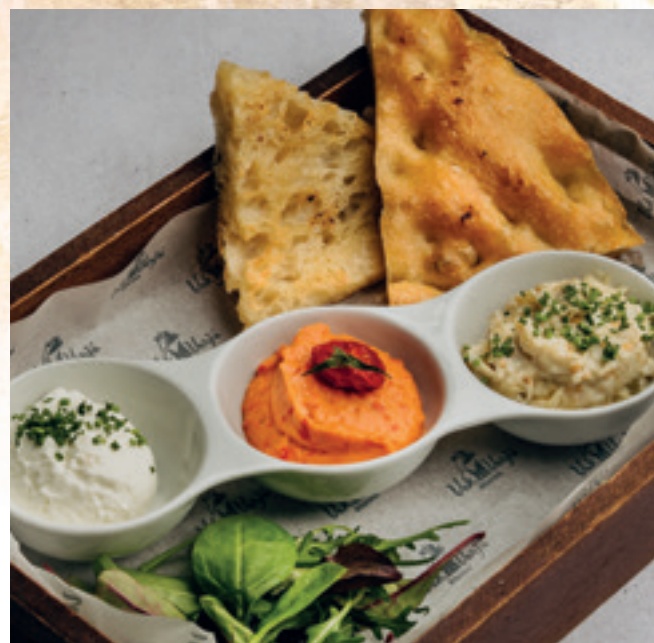
VakVarjú's dip selection with home-made focaccia: Transylvanian eggplant cream, kápiá pepper hummus, creamy goat cheese