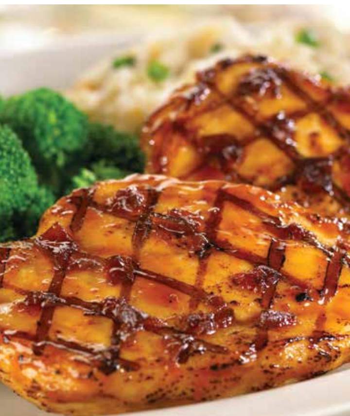
FRIDAYS™ SIGNATURE CHICKEN

FRIDAYS™ SIGNATURE SALMON & SHRIMP 8990,- A North Atlantic salmon filet is char-grilled and basted with our special Fridays™ Signature Whiskey Glaze. Then we add a handful of our butterflied shrimp, battered and fried until crisp. Served with steamed vegetables and cheddar mashed potatoes.