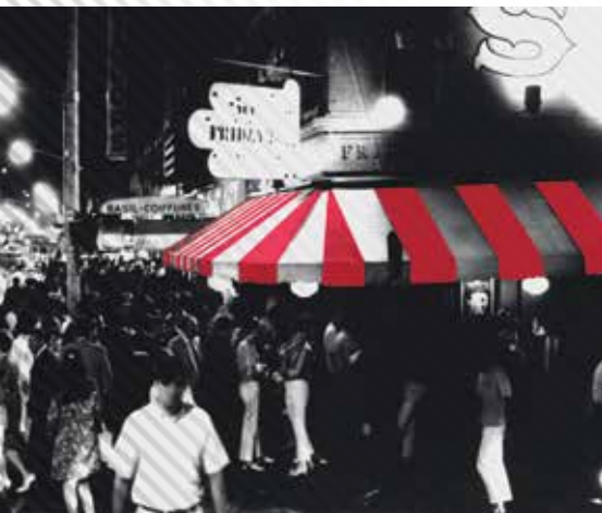
The first TGI Fridays in New York.