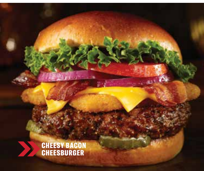
CHEESY BACON CHEESEBURGER