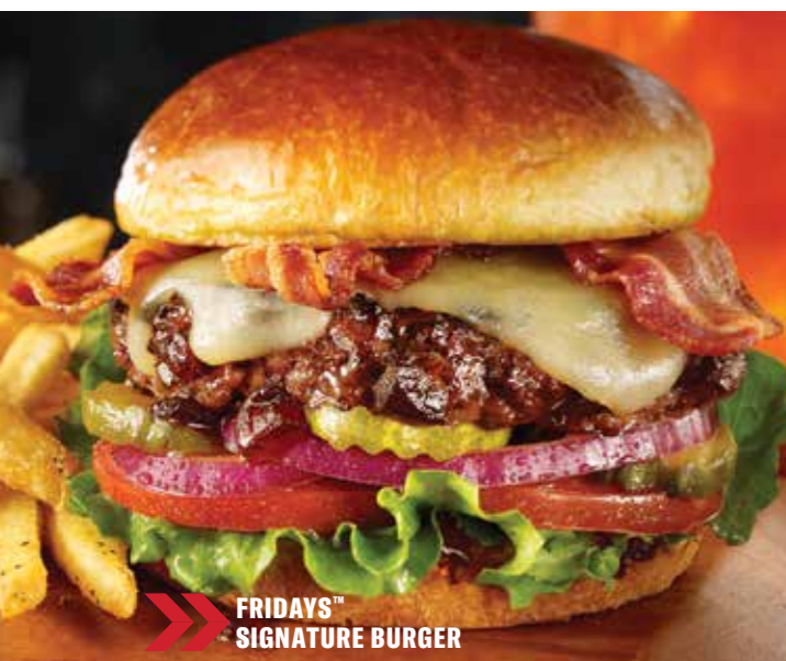
FRIDAYS™ SIGNATURE BURGER

ASK FOR ULTIMATE Make any burger an ultimate burger by adding an additional patty and crispy onion rings for 1590,-