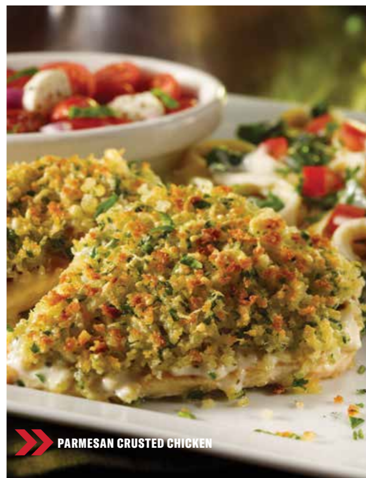
PARMESAN CRUSTED CHICKEN

FISH & CHIPS 4690,- Breaded, golden fried white fish strips served with crispy seasoned fries and tartar sauce.