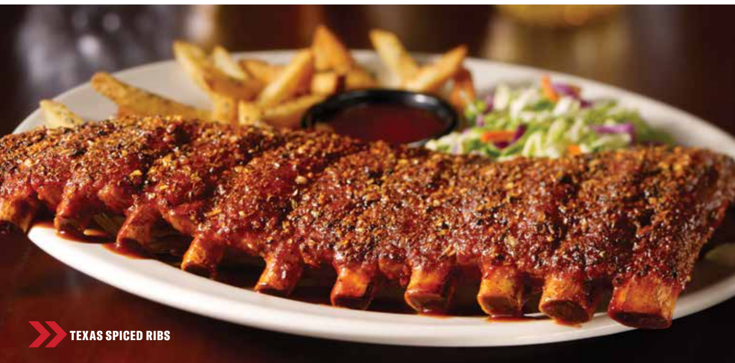
TEXAS SPICED RIBS

BABY BACK RIBS 7990,- This full rack of pork ribs is expertly cooked to ensure they're fall-off-the-bone tender. Then, we fire-grill them and glaze them with our tangy barbecue sauce and serve with our crispy seasoned fries and coleslaw.