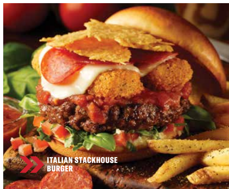
ITALIAN STACKHOUSE BURGER