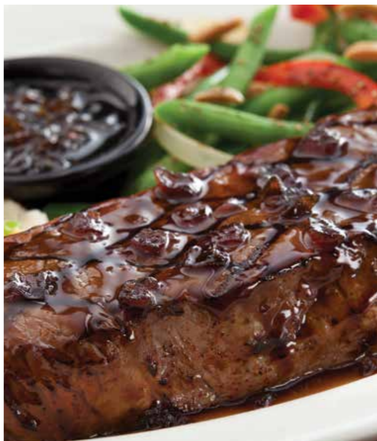
FRIDAYS™ SIGNATURE STEAK